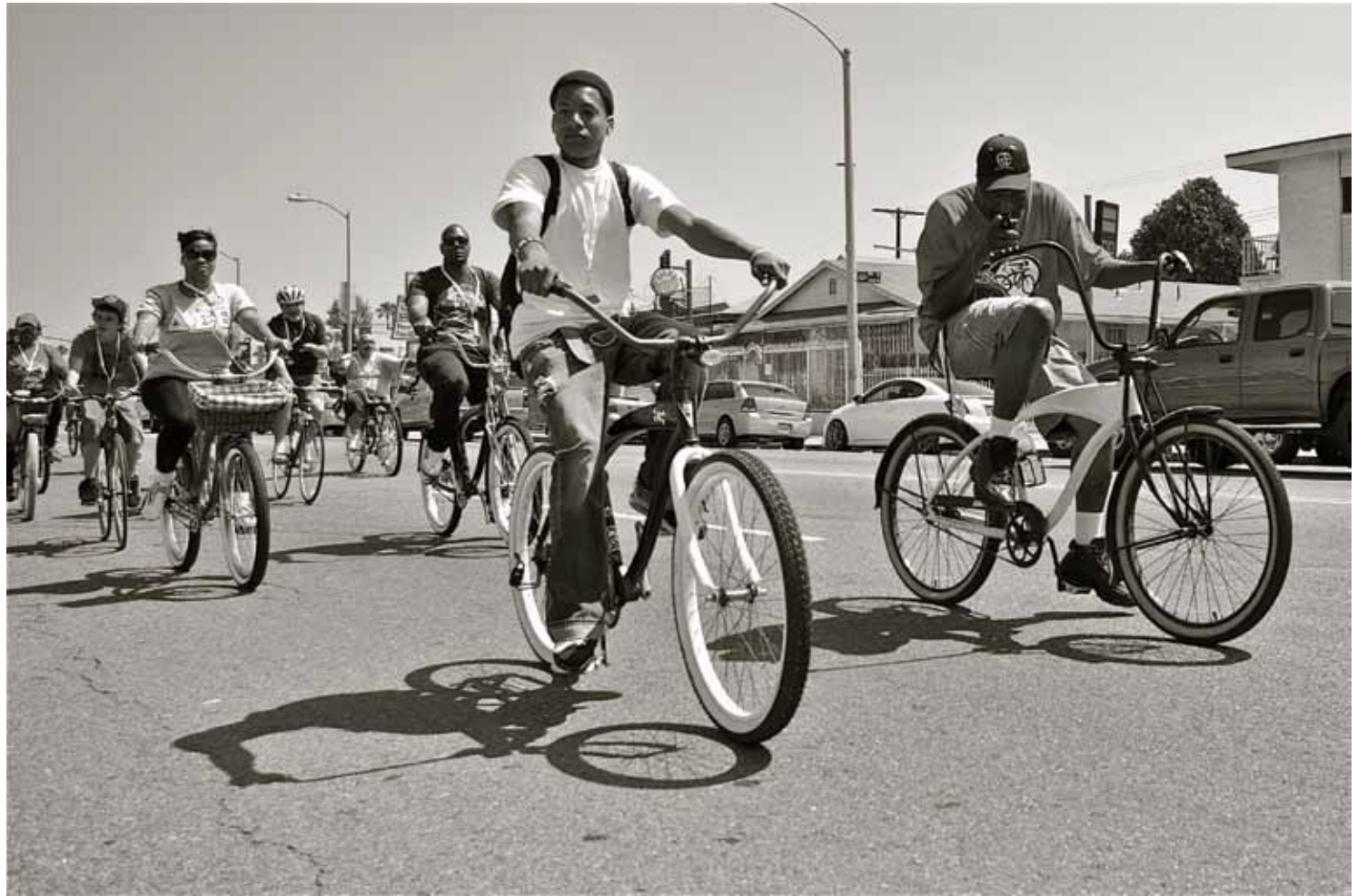
The Second Annual South L.A., Peace, Love and Family Ride & Fair brought a 10-mile bike tour through South Central Los Angeles that aims to raise awareness about childhood obesity. The tour ended with live music, food vendors, and information about healthy living. Seen here is the local bike club East Side Riders.