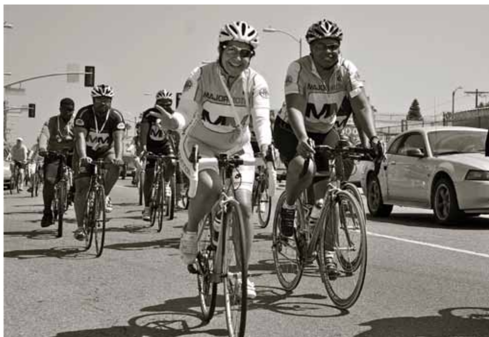
Major Motion Club.